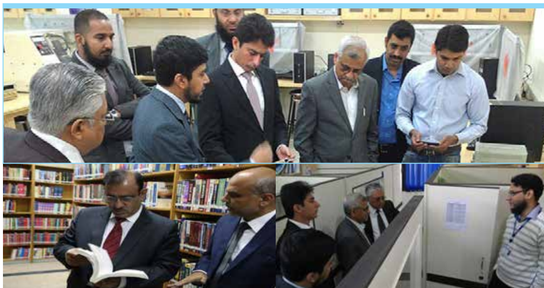
Snapshots of AIC visits to Institutes