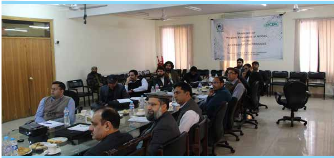
3 rd PE Training workshop at Peshawar held on February 16, 2017