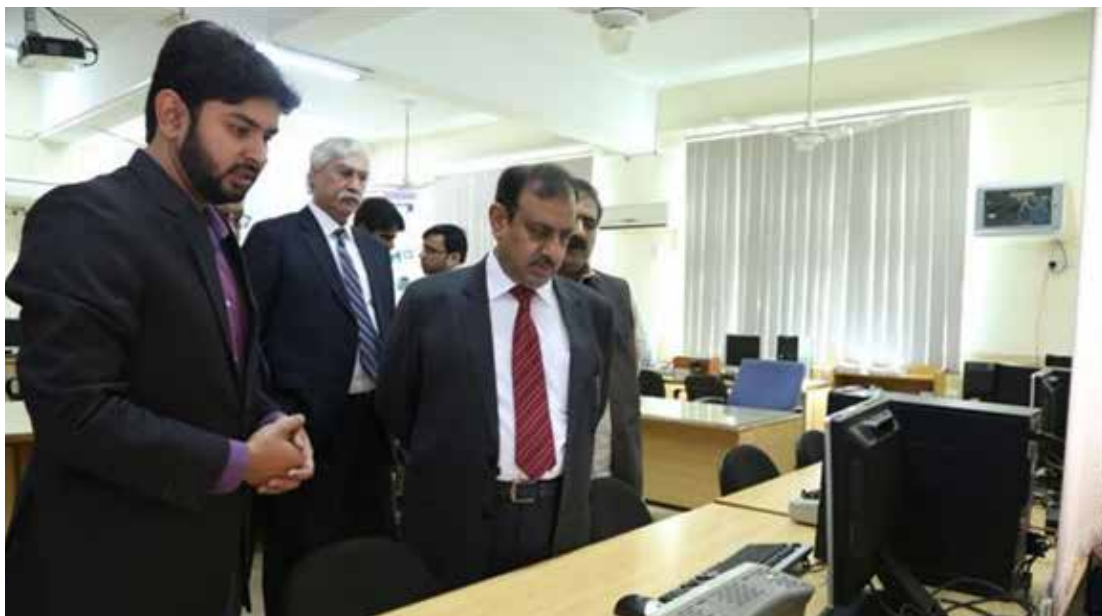
NCEAC AIC Members visit to SZABIST Islamabad Campus to be held on October 21, 2016