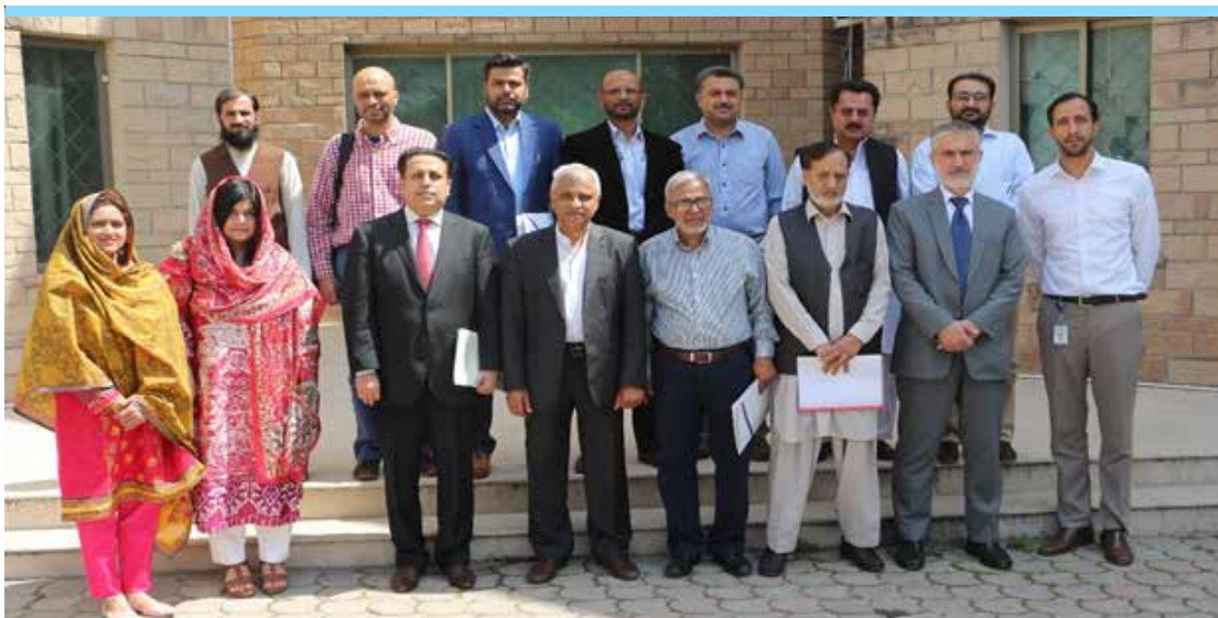
NCEAC 27th General Council Meeting held Oct 19, 2017