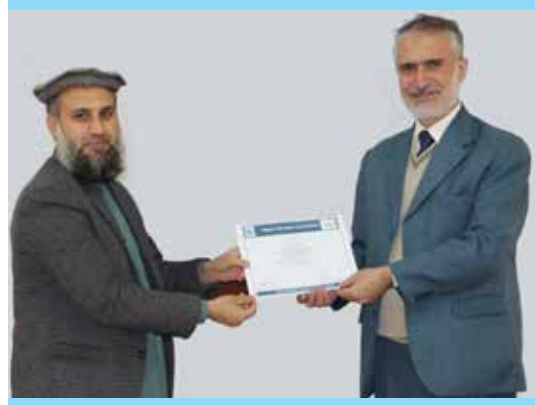
3rd PE Training workshop at Peshawar held on February 16, 2017