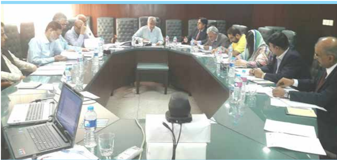
24 th General Council Meeting held on September 8, 2016