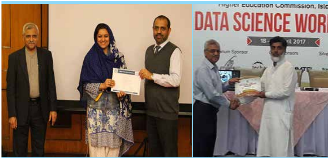
3 rd Program Evaluators Training Workshop held on Feb 10, 2017 at Islamabad