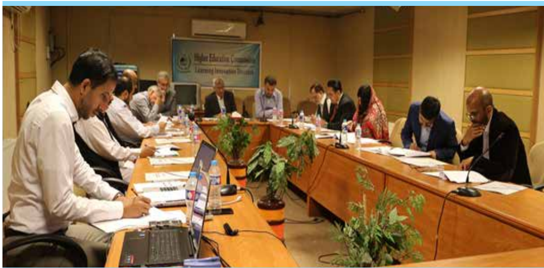
NCEAC 26th General Council Meeting held March 31, 2017