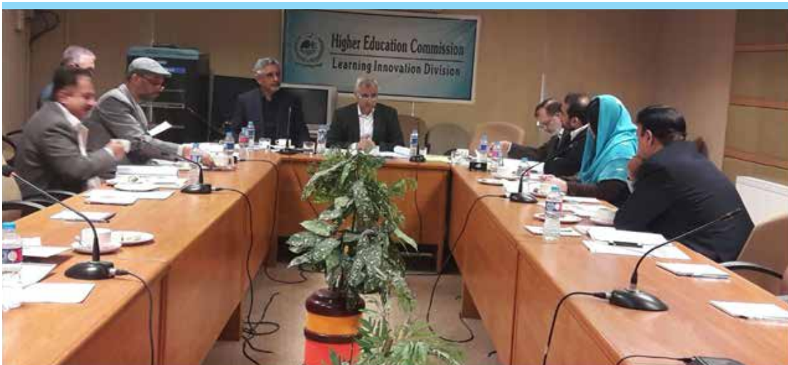
25 th General Council Meeting held on December 9, 2016