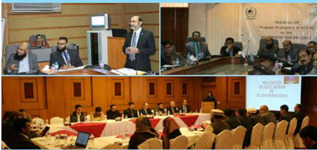
27 th General Council Meeting held on October 19, 2017