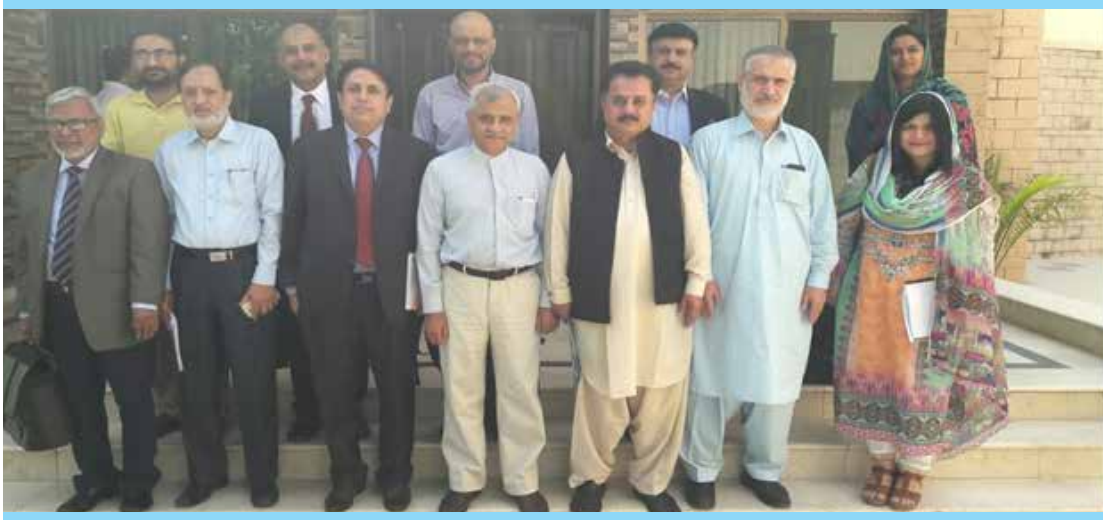
24 th General Council Meeting held on September 8, 2016